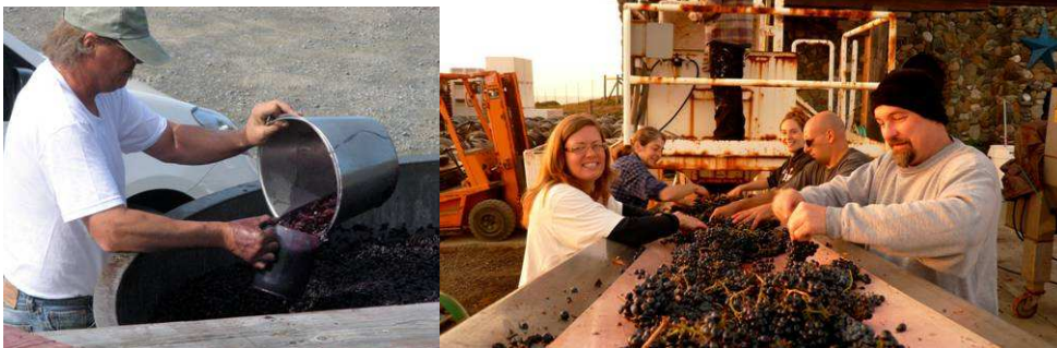
Making Wine The Old Fashioned Way... By Hand

Always a party at the winery! The Ab Feed... Yummy