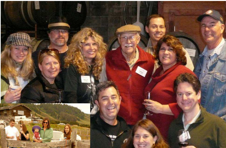
Always a party at the winery