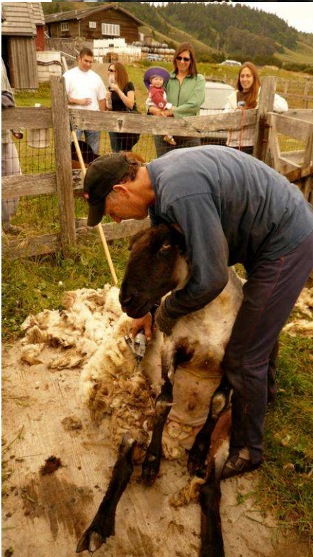
Denver gets a "wool cut"