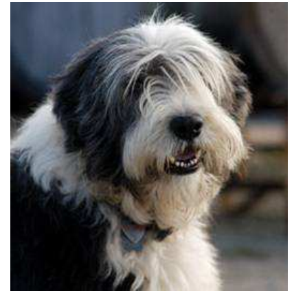
Spot, 16 years ~ We miss you!