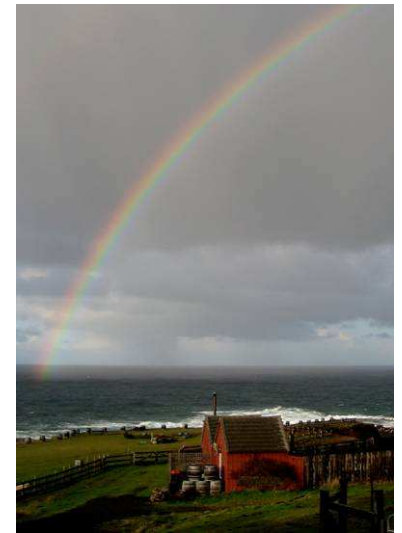
Rainbow over the bung-a-low