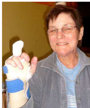
Diane undergoes repairs